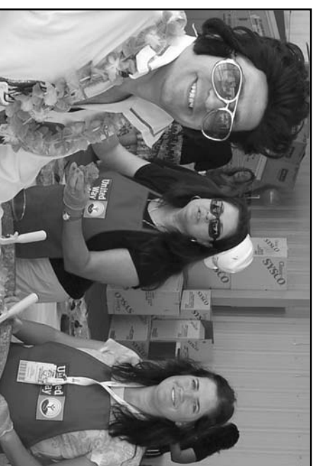
Sponsor for Champions of the Community

Big Brothers Big Sisters Bj's Wholesale Club Boys and Girls Clubs of Martin County Brad's Roofing Co. Inc. Braswell Surety Services Inc. Buford Construction Co. Inc. C & W Computers Catholic Charities Century 21 - All Professional Century 21 - Horizon Properties Challenger School Children's Services Council Children's Home Society Church of God by Faith Cingular City of Stuart Clerk of the Circuit Court-Martin County Coastal Heating & Air Conditioning Inc. Colonial Bank Comcast